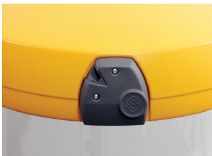
Keyed locking mechanism