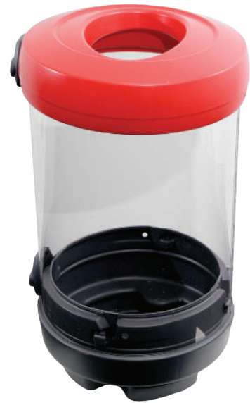
Oval shaped waste apertures