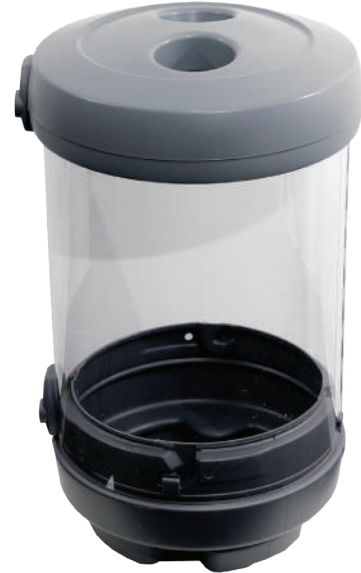
Cans & bottles waste apertures