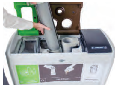
Standard top lid graphic*