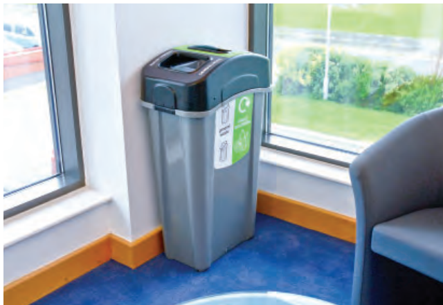
Nexus Duo 85 Litre