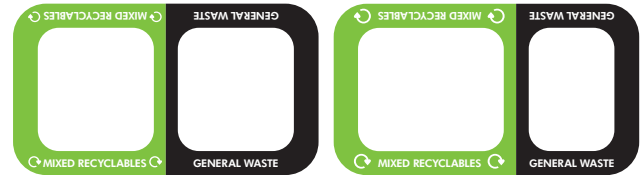
50/50 split lid.