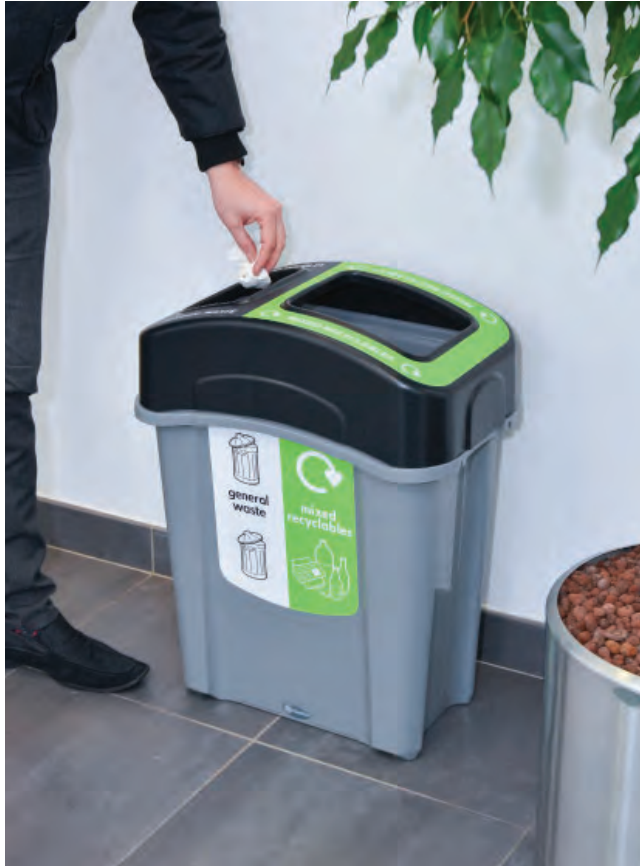
Nexus Duo 60 Litre