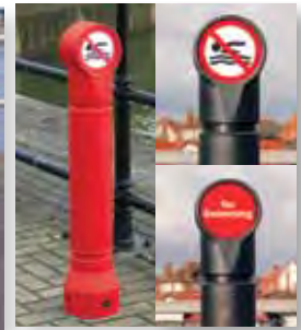
Mini-Ensign™ Sign Carrying Bollard