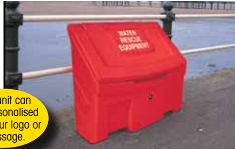
Slimline™ Storage Container

The unit can be personalised with your logo or message.